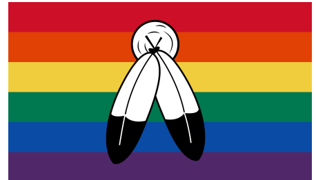
Two-Spirit Pride Flag