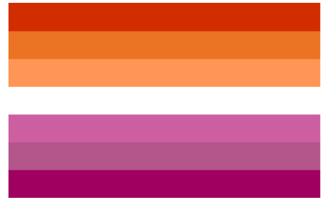
Lesbian Pride Flag