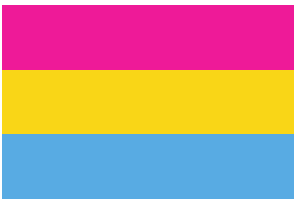
Pansexual Pride Flag