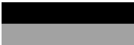
Asexual Pride Flag