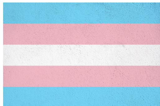
Transgender Pride Flag