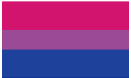
Bisexual Pride Flag