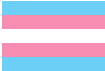
Transgender Pride Flag