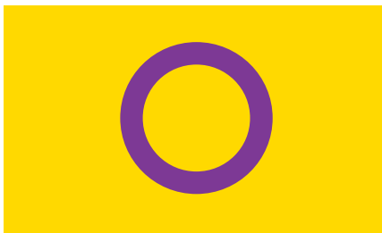
Intersex Pride Flag